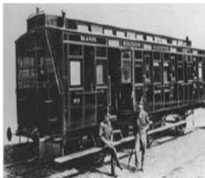
Orient-Express restaurant car in 1883

The Stars on the map indicate where our characters first boarded the Stamboul Calais Coach, in Istanbul – this is where Poirot, Debenham and Arbuthnot first met. It also shows the town of Belgrade where they stopped to pick up the additional passenger car.