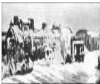
Orient Express Snowed in

Above are some actual photos of the Orient Express, including the small one on the right which shows the Orient Express being snowed in on the tracks.