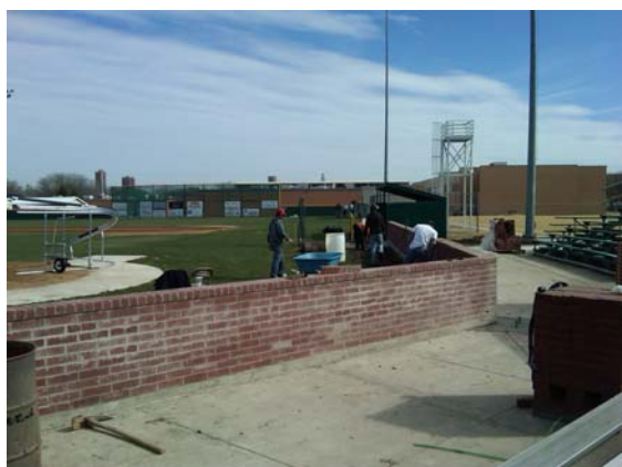
Upgraded brick wall backstop

With over 40 volunteers on a sunny January Saturday, Bronco Field has taken on an improved look. Things you notice the next time you take in a ball game are: New brick backstop (Thanks in large part to ACME Brick); new netting system (Thanks to Hurricane Fence and Sunbelt Rentals); and flagpole relocated to Center Field.