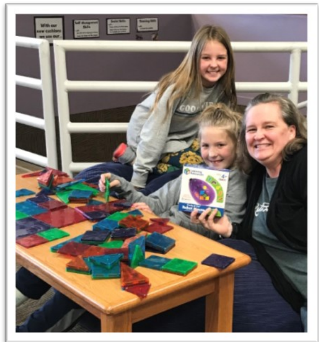
Newton Rayzor Elementary