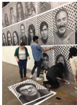
exhibit. Many of them

were also a part of the installation at the museum that took place on January 9 th . JR, a semi-anonymous French street artist, uses his camera to "show the world its true face, by taking and pasting photos of human faces across massive canvases" and then exhibiting