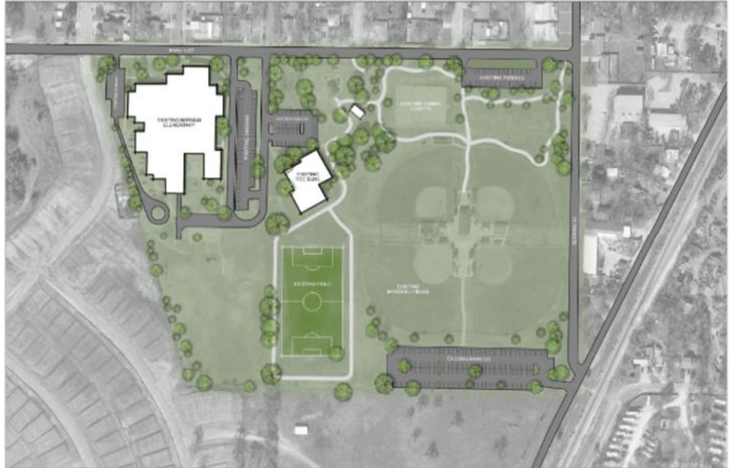
EXISTING SITE LAYOUT