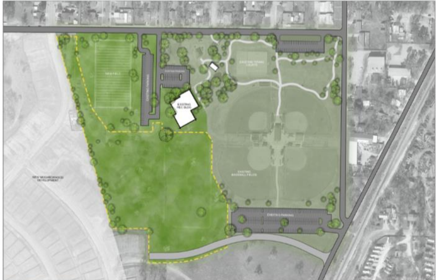
NEW SITE LAYOUT