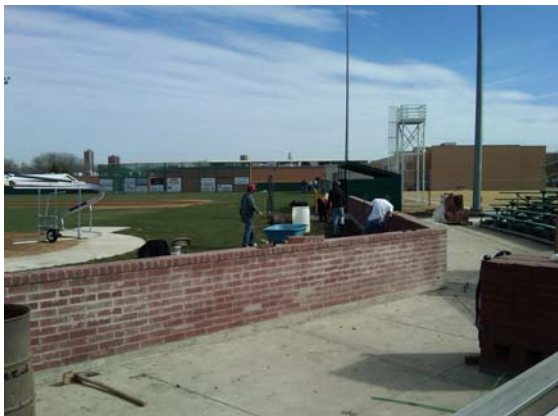
Upgraded brick wall backstop

With over 40 volunteers on a sunny January Saturday, Bronco Field has taken on an improved look. Things you notice the next time you take in a ball game are: New brick backstop (Thanks in large part to ACME Brick); new netting system (Thanks to Hurricane Fence and Sunbelt Rentals); and flagpole relocated to Center Field.